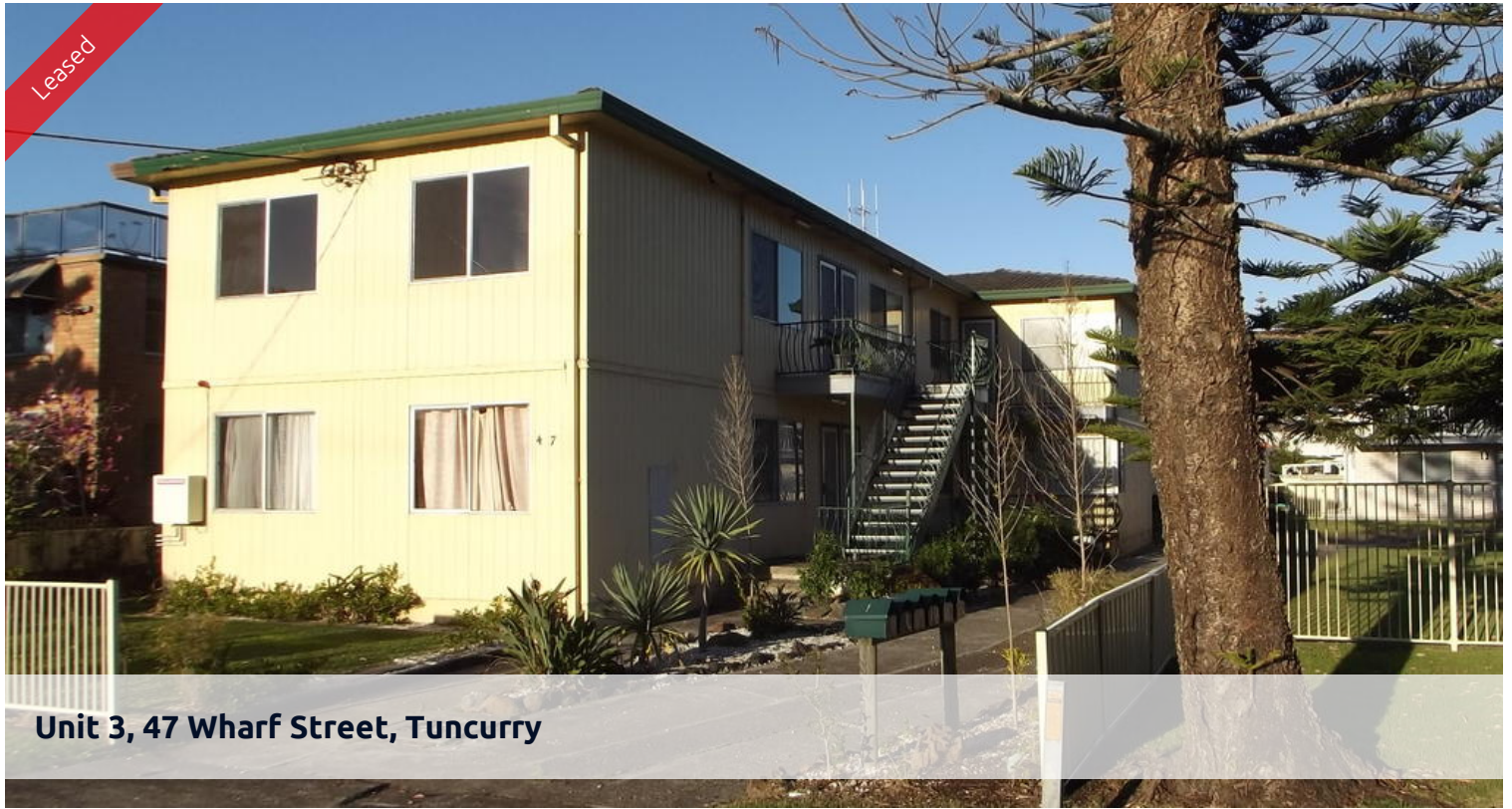
Unit 3, 47 Wharf Street, Tuncurry