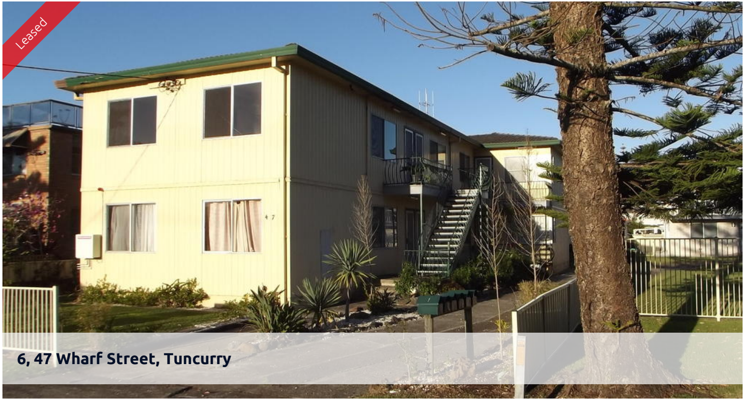
6, 47 Wharf Street, Tuncurry