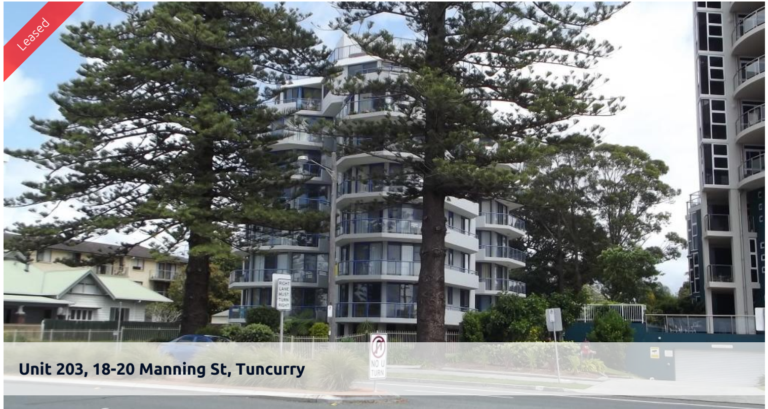
Unit 203, 18-20 Manning St, Tuncurry