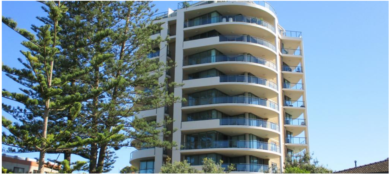
Unit 502, 21-25 Wallis Street, Forster