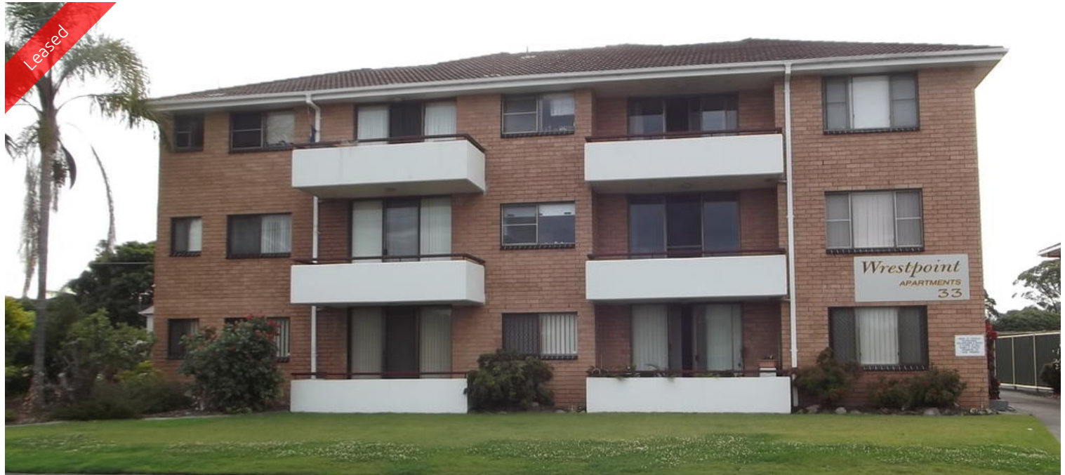
Unit 8, 33 Point Rd, Tuncurry