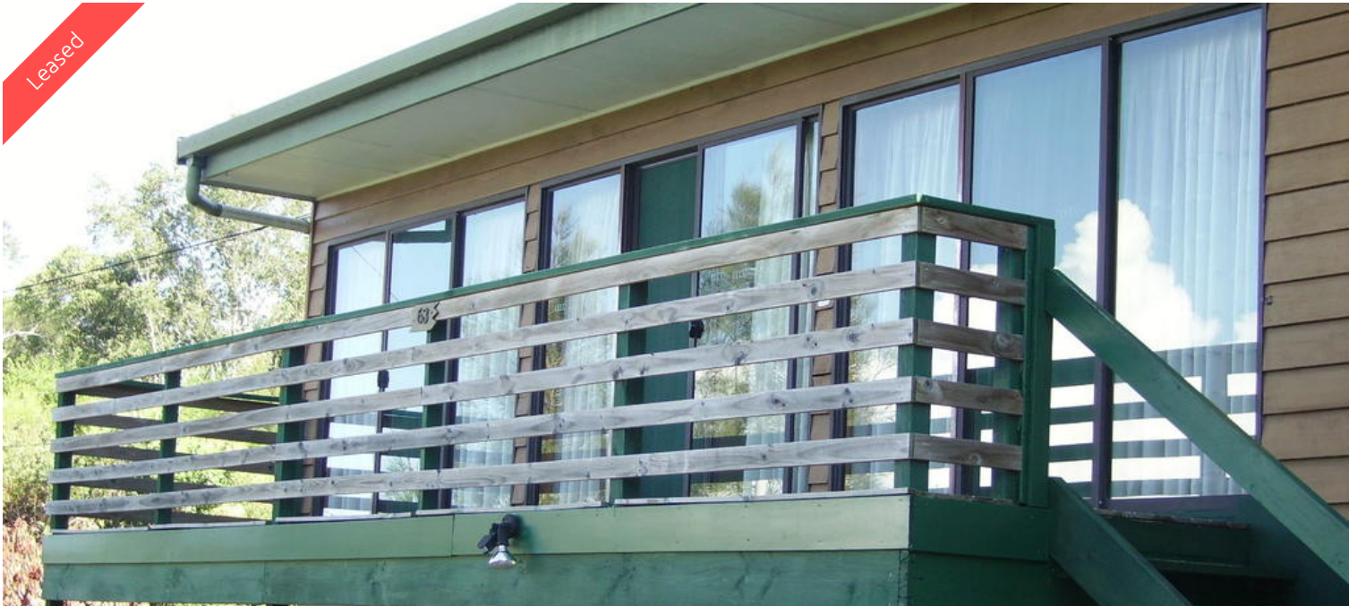
63 Seabreeze Parade, Green Point