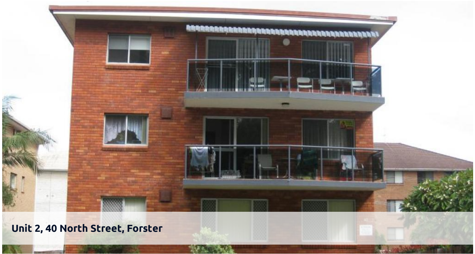
Unit 2, 40 North Street, Forster